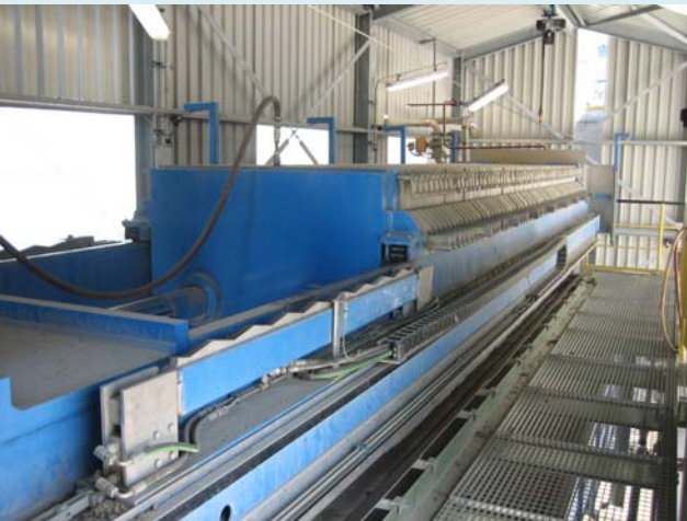
typical APPS multiple plate transport & shaker system mounted on a 1,500mm filter press